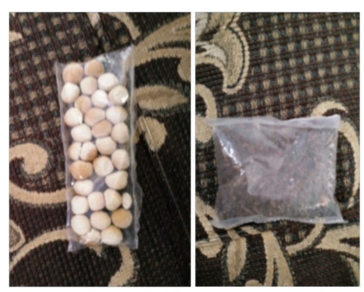
Figure 4. Parem (bottom scrub powder) and Incense

During those 40 days after giving birth, when she sits and sleeps, they believe that the position of the woman's feet must be straight and tight, so that she does not get varicose vein and the reproduction organ becomes tight a gain. Women who do not want to get pregnant again, also consume a certain kind of jamu to prevent them from being pregnant. This type of jamu is believed to have "hot character", so that the reproductive organ—uterus-- is not in a condition to accept a fertilized egg.