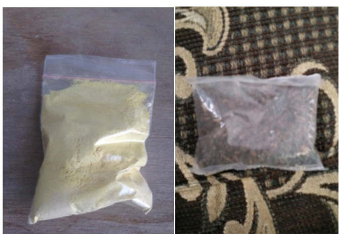
Figure 3. Scrub and wood incense

For most people, marriage is a very happy moment, not only for the couple who are getting married but also for both families of those couple. The preparation before the marriage is months before the ceremony. Taking care of the body before the marriage is very important for the woman. For the bride to be, body is prepared very well so that she looks very attractive during the ceremony. The woman's body who is going to be the bride must be taken care by using "cold face powder" and scrub— lolor , made of traditional herbs.