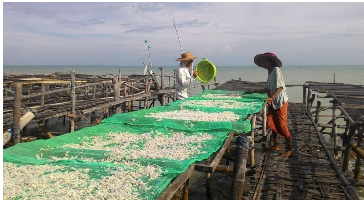
Figure 2. The process of drying the fish

In the economic sector, people in Madura earn their money from farming, fishing, trading, and becoming the government workers--civil servants (Kuntowijoyo 2002). Women have important role in the family's economy. They sell goods at the market. Most sellers in the market are women. Grocery sellers in the shopping center are mostly women too. The people in Madura are mostly farmers and fishers because the island is surrounded by the sea (Rifai 2007). In the farming sector, Madurese men and women have division of work equally, in this case the men hoe and plow the rice field, while the women weed and seed the rice field. Madurese women who live in the coastal areas generally work as fish sellers, and dry the fish that the husband captured from the sea.